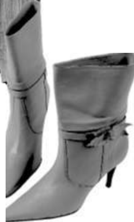
Pretty Fit leather boots $100, Novo, Broadway on the Mall, Brisbane City, 3229 8480.