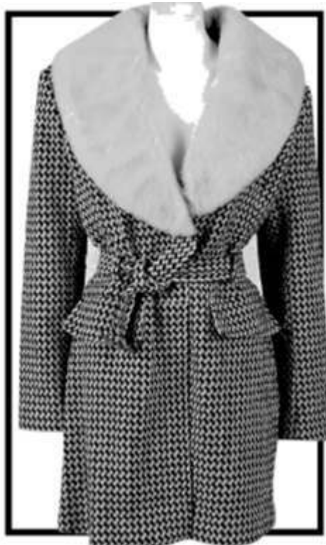
Miss Shop check wool jacket with faux fur collar $104.30, Myer, Brisbane City, 3232 0121.