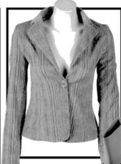
Desire pink cord jacket $55, Quad Dimension, Broadway on the Mall, Brisbane City, 3210 0616.