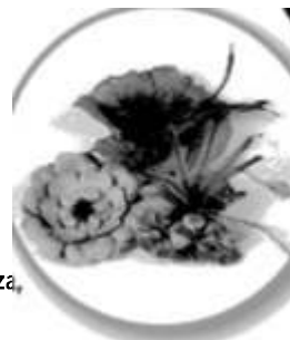
Alannah Hill silk flowers, from $19, Alannah Hill, Queens Plaza, Brisbane City.